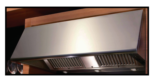
The Magnum is an excellent replacement hood for your updated pro cooking. Installs easily to the bottom of your cabinet. Now recirculating filtered air back into your kitchen has never been easier with a new ductless vent grate kit